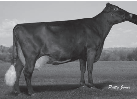
Lynmark Clay Equity EX-90

All four nominees in the 2010 Cow of the Year contest received multiple votes, demonstrating the depth of quality in the contest. The other nominated cows were: