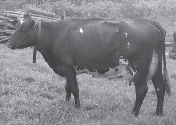
Fieldcrest Ideal EX-92-3E