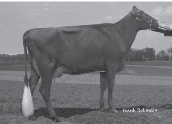
Headacher Logic Doris VG-86